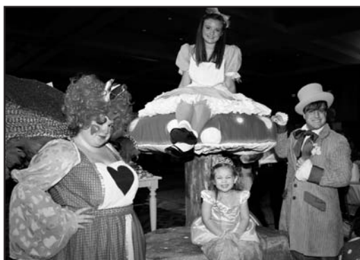
The Queen of Hearts, Alice, a young guest and the Mad Hatter

As the festivities wore on, everyone - especially Rapunzel - began to let down their hair. During a rather dramatic moment on