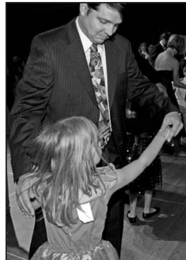
Father and Daughter Dance